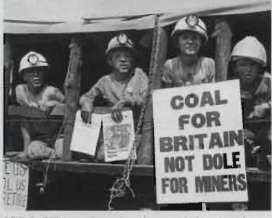
1984-85 A yearlong showdown with the miners' union brought misery to many mining communities, but the rest of Britain continued working.

Schmidt was spectacularly wrong about Thatcher's inability to lead. And nowhere was her command, her authority, in greater evidence than in the Falklands War, the event that cemented her reputation as "Leaderene" and as a British prime minister of irrepressibly bellicose patriotism. After Argentina invaded the Falkland Islands in April 1982, Thatcher swiftly dispatched a naval task force to evict the Argentines. The United States reacted queasily to the prospect of war in the Western Hemisphere, and Reagan, to Thatcher's dismay, dispatched his secretary of state, Al Haig, to try to broker a deal between London and Buenos Aires. Not a hope. She'd seen off everyone who behind the scenes pressed her to back down. Henry Kissinger happened to be visiting London at the time and witnessed the caballing against her. Over a lunch at the Foreign Office, Kissinger was informed by the foreign secretary, his staff, and all the former foreign secretaries in the room that they were "in favor of negotiation." Later that day, Kissinger asked Thatcher which of the various negotiating options she favored. "That," Kissinger says, "led