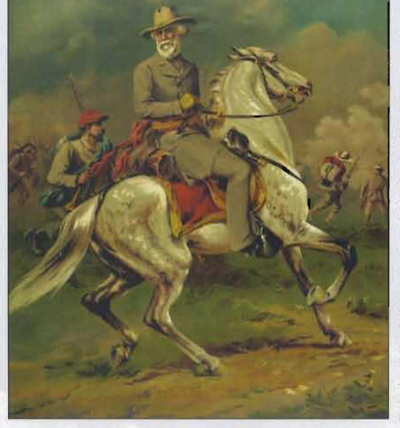
Robert E. Lee, leader of the Confederates

The American Civil War was unspeakably brutal, and the number of casualties unprecedented. The conflict was the first to rely on the deadly technology of modern warfare: submarines, machine guns, aerial surveillance, trains, trenches and land mines. The four-year struggle between the North and the South, from 1861 to 1865, would cost the lives of more than 620,000 soldiers and 50,000 civilians. Even to this day, the defeated South bears the emotional scars of the war, and its people discuss the conflict as if it were a recent occurrence. What is never acknowledged, however, is the pivotal role played by Britain in the war – or the fact that tens of thousands of Britons took part. Some lost their lives in horrific circumstances; others witnessed unimaginable levels of butchery and torture.